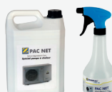
CLEANING KIT HP